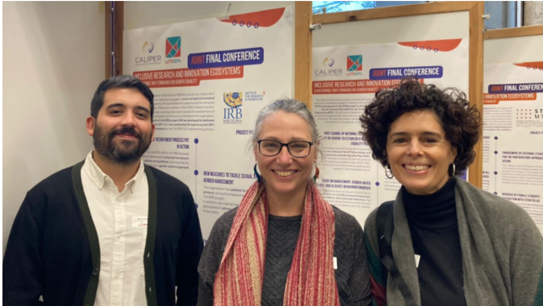
Figure 4. CALIPER partners from IRB Barcelona in front of their Institution's poster

exhibition was featured, presenting key highlights that project partners cherish and put forward out of their CALIPER and LeTSGEPs experience respectively.