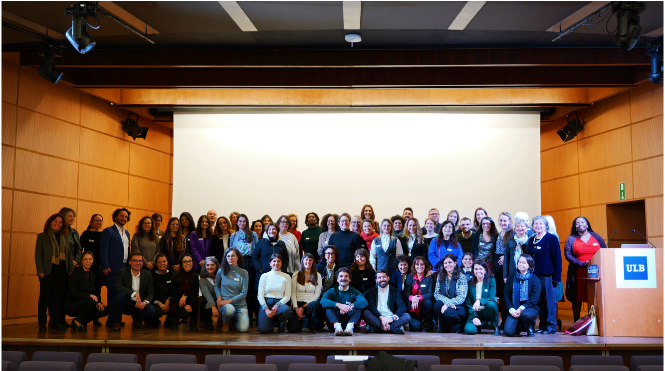
Figure 1. CALIPER & LeTSGEPs partners and Conference speakers group photo

CALIPER project joined forces with sister Horizon 2020 project, LeTSGEPs, to co-organise their final conference on Thursday, 23 November 2023, an event attended by a total number of 150 people physically and online. The event was hosted by Université Libre de Bruxelles (ULB), member of CALIPER consortium, and it was titled “Inclusive Research & Innovation Ecosystems: A sustainable way forward for Gender Equality” .