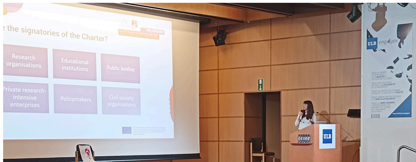
Figure 5. Presentation of the CALIPER Charter