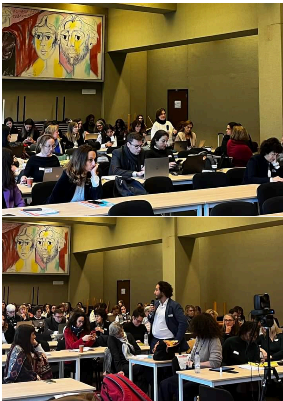
Figure 3. Moments from conference panels

At the halfway point of the day, the conference had an extended lunchbreak that was also dedicated to a relaxed networking opportunity among sister-projects, external peers and project teams. During the break a posters